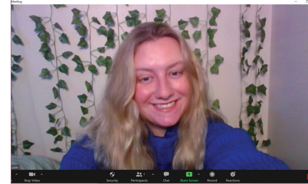
EXAMPLE GOOD BACKGROUND