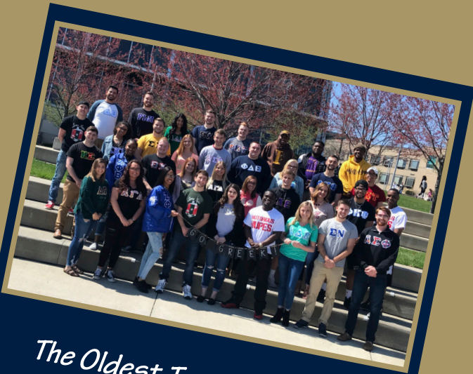
The Oldest Tradition at UA!

There are many ways to support your student during exciting times, as a life-long decision of membership should not be taken lightly. Encourage your student to be confident and show their genuine self.