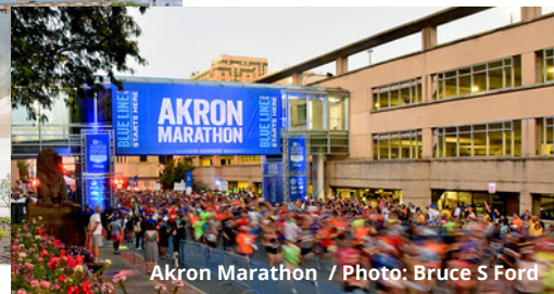
Akron Marathon