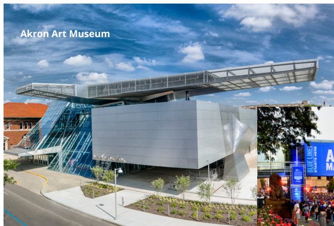
Akron Art Museum