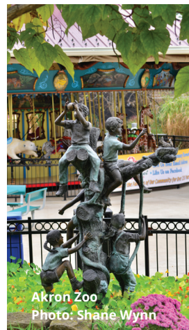
Akron Zoo