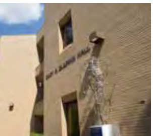
MARY GLADWIN HALL

The Rec Center, free to all students with a Zip Card, has repeatedly been ranked among the best in the country. It contains cardio and strength equipment, basketball and all-purpose courts, an indoor track, a pool and lazy river, and a 53-foot climbing rock wall.