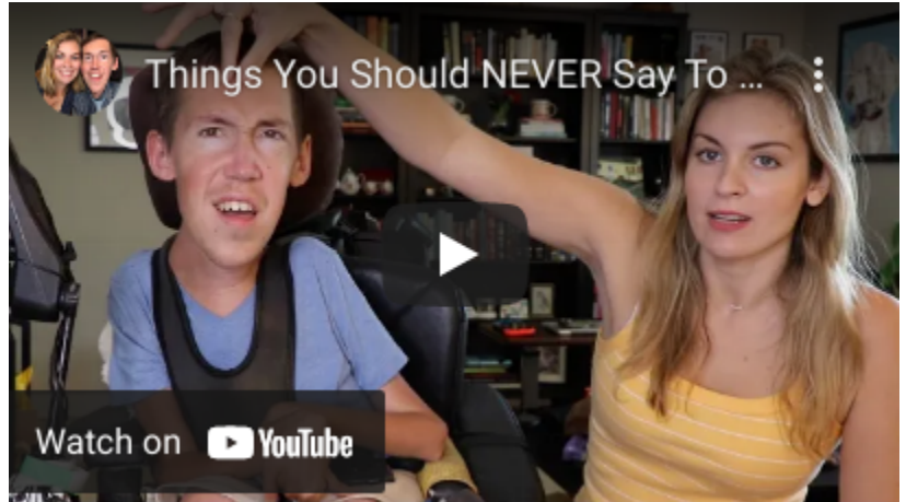
Things You Should NEVER Say To A Disabled Person - YouTube

This video content has been made available for informational and educational purposes only. Office of Accessibility and The University of Akron does not make any position with respect to the accuracy, applicability, fitness, or completeness of the video content.