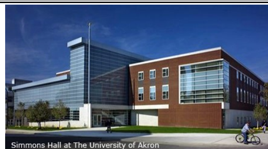
Simmons Hall at The University of Akron

Fall & Spring Office Hours: Monday, Tuesday, Thursday, & Friday 8 a.m.-5 p.m. Wednesday: 8 a.m.-7 p.m.