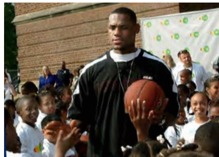
Akron, Ohio: Home of LeBron James